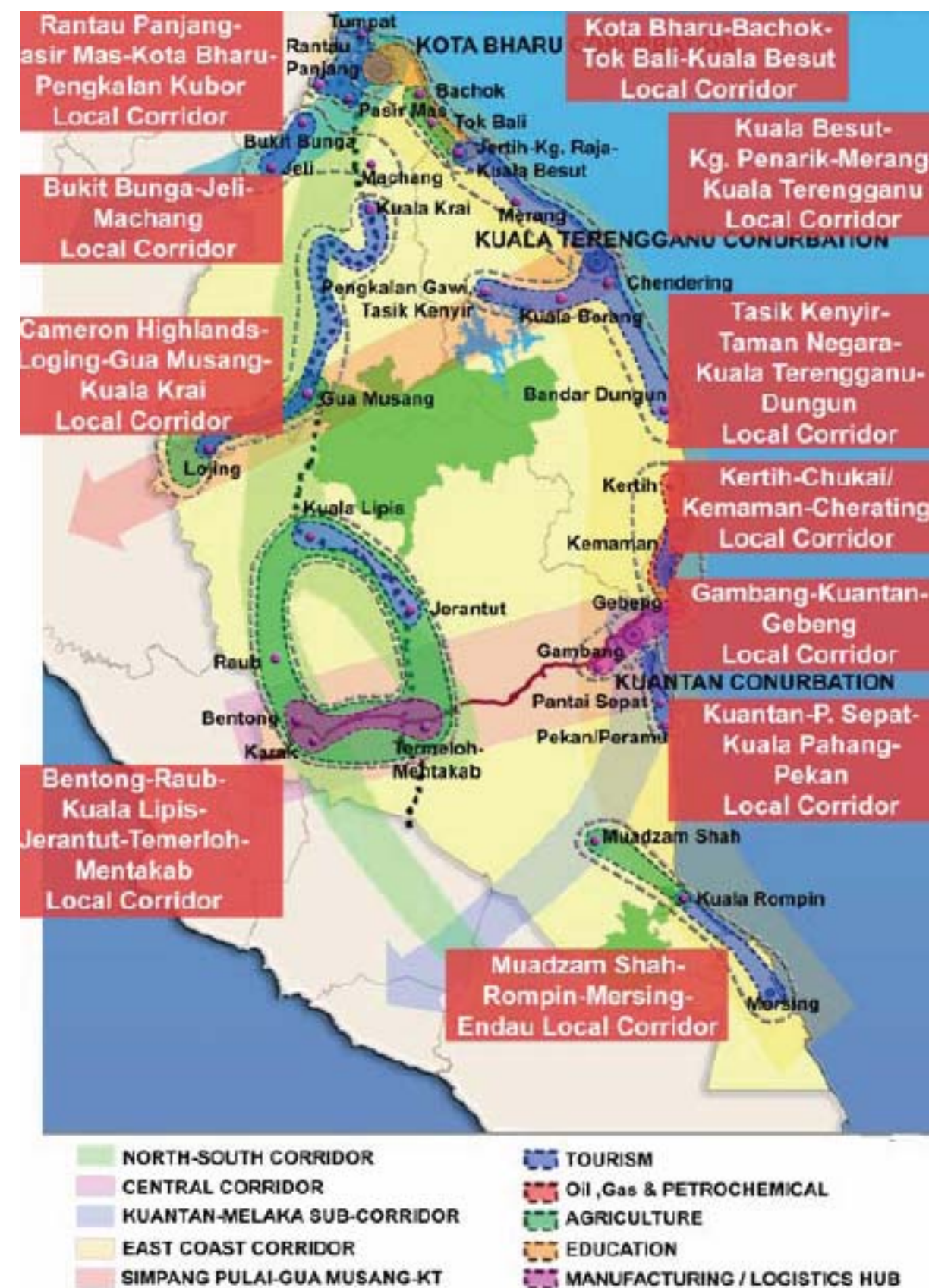
Figure 2.1: The East Coast Corridors and its division of sectors by ECER.

The East Coast is a part of Peninsular Malaysia in Malaysia, which includes Kelantan, Terengganu and Pahang. The East's prime attractions are some of islands, featuring great beaches and excellent scuba diving. It is also the most culturally conservative part of Malaysia. The economy is largely based on agriculture. According to ECER, several corridors are identified for the development. These corridors have their focus. The purposes of these corridors are to coalesce the initiatives in the corridors and identified the main project and future potential development.