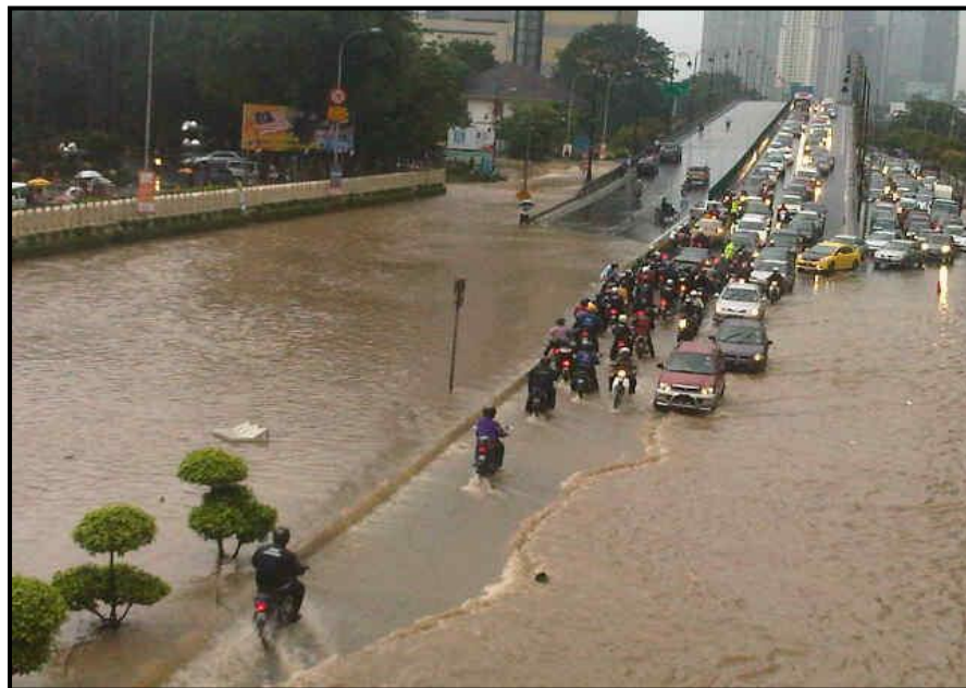
Figure 1.1: Water Ponding on the Road Surface

Thus, this study was conducted to establish storm water criteria that can contribute to green highway assessment. Improper storm water management will cause some problems such as clogging and water ponding on the road surface. Therefore, these criteria proposed can be use as a guide for the road engineers towards environmental awareness.