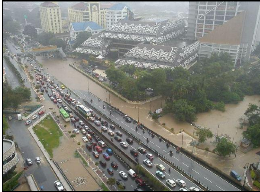
Figure 1.2: Road Congestion due to effect of Storm Water