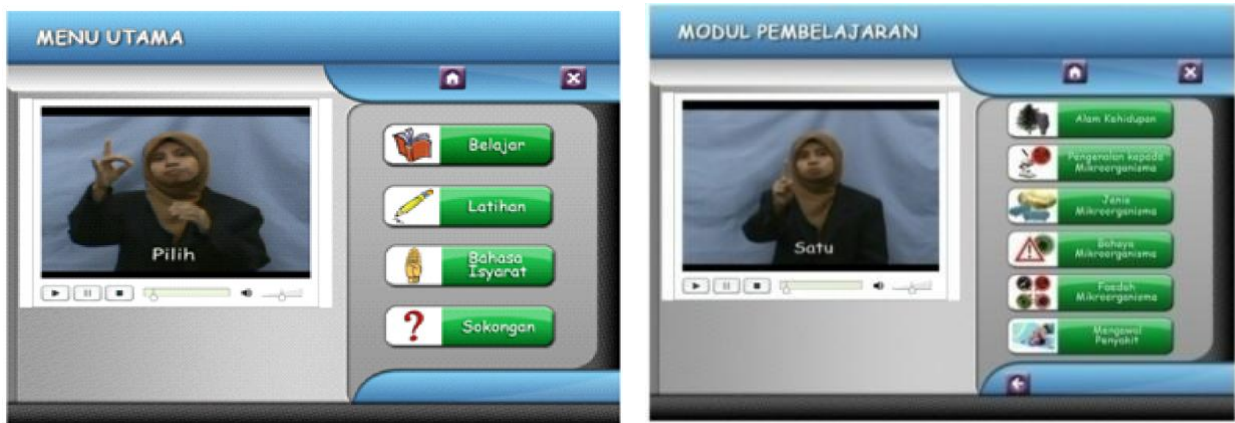
Fig. 3 The Main Menu and Learning Module of PekAR-Mikroorganisma