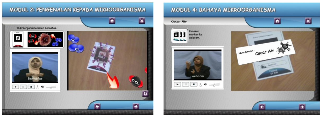
Fig. 4 Example of AR environment in courseware in module 2

The first screen in the courseware is the main display screen which can be seen in Fig. 2. The display starts with the name of the application which is PekAR-Mikroorganisma . “Pek” stands for Pekak or in the Malay language it means the hearing impaired. “AR” is augmented reality and Mikroorganisma means Microorganism. A multi-coloured interface with pictures of mushrooms was