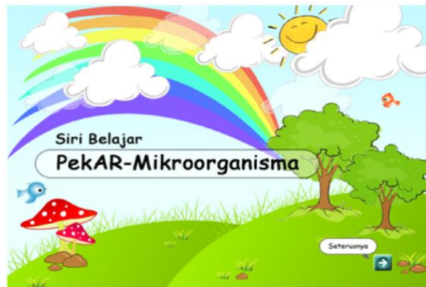
Fig. 2 The Introduction of PekAR-Mikroorganisma