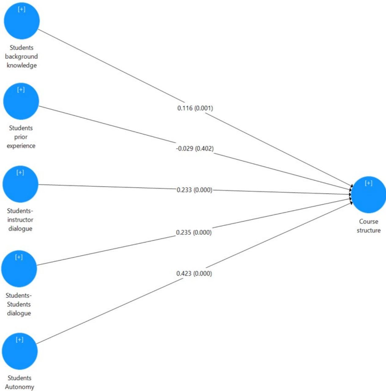
Figure 3. Structural model assessment

affect course structure, and the bootstrapping test showed a highly significant level of both indirect paths with \beta= 0.043 and \beta= 0.031 , respectively. However, the results revealed that Students’ prior experience has an insignificant level with course structure ( \beta= 0.035 ).