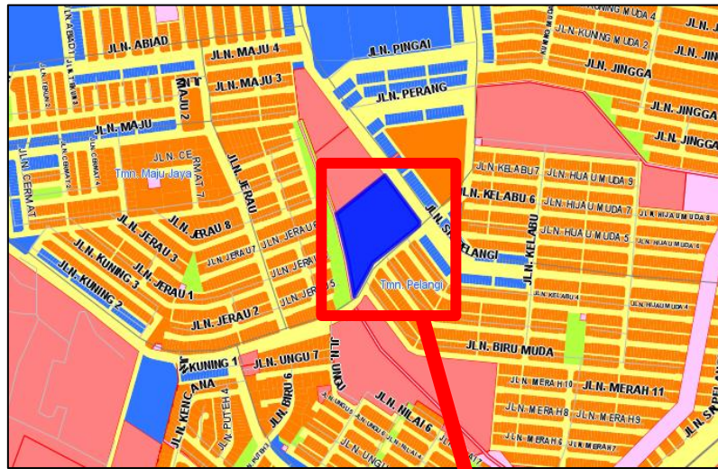
Figure 1.1: Map of the study area

The study area is at Taman Pelangi Johor Bahru have been selected in thesis. This area are placed under Majlis Perbandaran Johor Bharu (MBJB) in Mukim Plentong. This area is located at 1^{\circ}28'45.55'' N, 103^{\circ}46'22.03'' Figure 1.1 to figure 1.2 show the location of the study. Landuse for this area is housing and the area really near to Johor Bahru City which in 2.4km away and also easy access transportation about 5km to Larkin bus station.