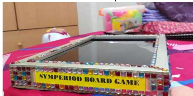
Figure 2. Symperiod Board Game (SBG), a tool for enhancing students' cognitive development

In order to ensure that the product meets the learners' needs, the instruction, and the stated instructional goals, each step was systematically followed with continuous evaluation by the expert. The project is set to develop the cognitive skills of the player.