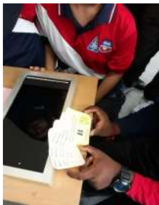
Figure 5. Students preparing to initiate the instructional game

simple to complex, as expressed by (Hanna 2007). According to Munzenmaier & Rubin (2013), a learner cannot understand a concept if he/she does not first remember it.