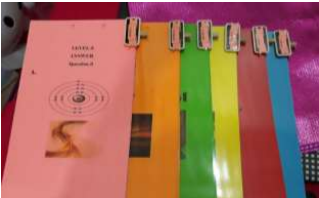
Figure 3. Answer slides for SBG