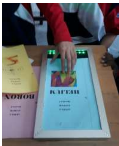
Figure 4. Students playing SBG in the classroom

The Form IV secondary school chemistry students demonstrated good knowledge of the subject matter in chemical symbols and periodicity based on regular classroom instructions delivered by their teachers. Although most of the respondents could not respond correctly to half of the total test items, they demonstrate a level of cognition we termed "fair cognition" from pre-tests administered to all groups involved in the study. Initially, students performed moderately during pre-test due to limited cognition gained during conventional classroom instruction. With the introduction of intervention which comes with activities to improve one's abilities, the performance becomes dynamic throughout the levels of engagement. The "treatment level 1" indicated a modest improvement in the students' scores. The researchers consider this modest improvement because the items in "level 1 treatment" seek for student's fair cognition. Similarly, Table 4, which represented the rating scale of students' cognitive levels based on individual or mean scores of the test, indicated that 9.8 mean scores fall within the "average scale." It implies that the respondents of Group B were rank under "lower cognitive level."