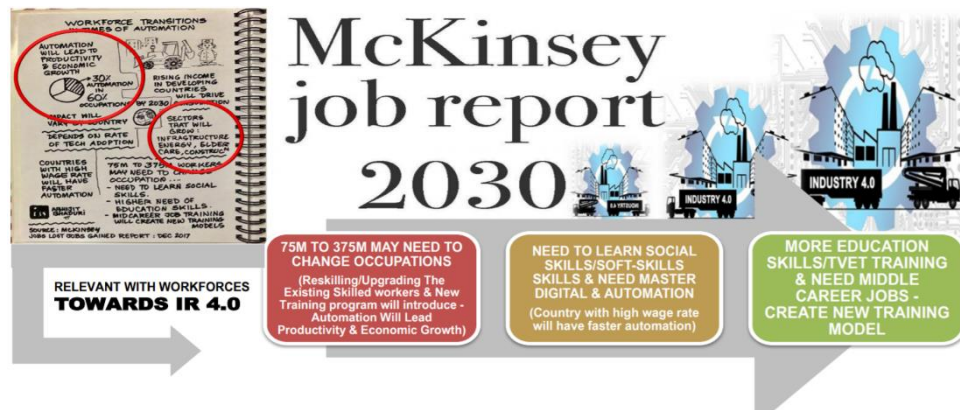
Figure 1: Relevant Workforce Toward IR4.0

global unemployment, persistent poverty, widening inequality and expanding threats to peace and safety.