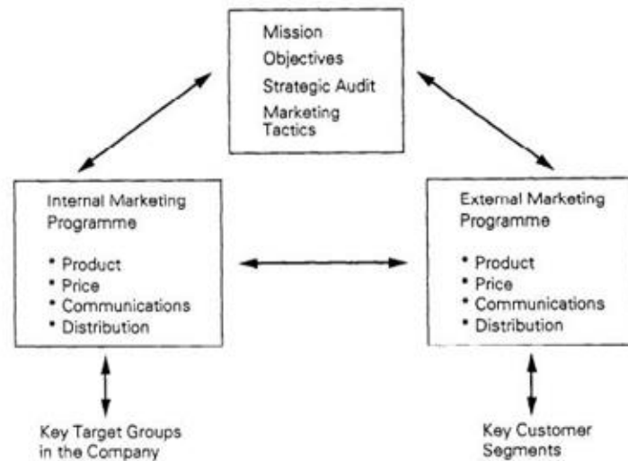
Fig. 1. Marketing Plan [9]