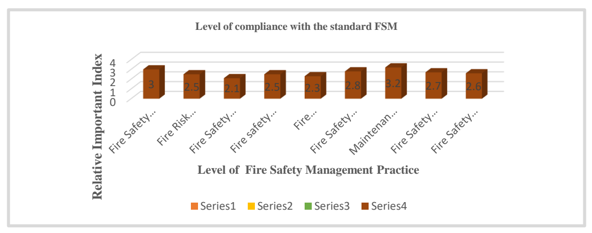
Figure 1: showing the results of level of FSM practice

Vol. 10, No. 8, 2020, E-ISSN: 2222-6990 © 2020 HRMARS