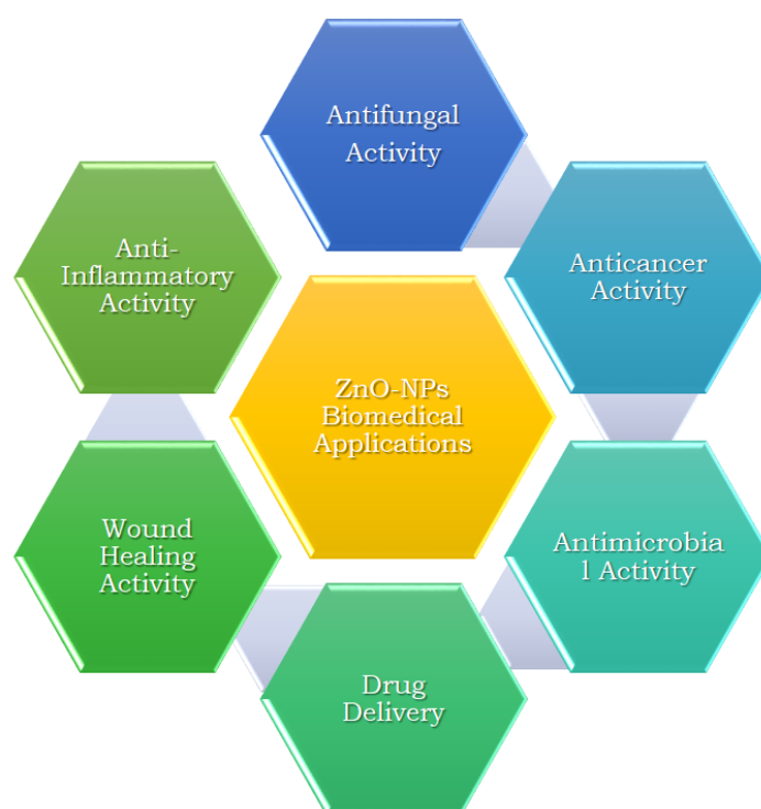
Figure 1. Potential biomedical applications of green synthesized ZnO-NPs.

A recent development in the emergence of nanotechnology and ZnO-NPs has led to significant enhancements in biomedical applications of nanomaterials. Use of natural raw materials and living organisms as capping and reducing agents for the synthesis of ZnO-NPs provided better biocompatibility and responses for their interactions with biological tissue which enhances their performance substantially. As a result, green synthesized ZnO-NPs are famous as effective and viable nanoparticles that can be used to target bacterial infections, devastate the membrane of cancerous cells or deliver various compounds to diseased tissue, and to measure concentrations of distinctive biomarkers inside the body. Since numerous literatures is available for different applications of ZnO-NPs in biology and medicine, Fig. 1 represents the diverse biomedical applications of ZnO-NPs that are elaborated below.