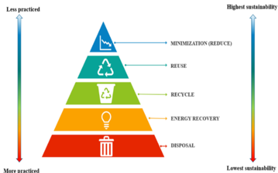
Fig. 2(a). Waste management Hierarchy Adapted from Cristóvão [39]