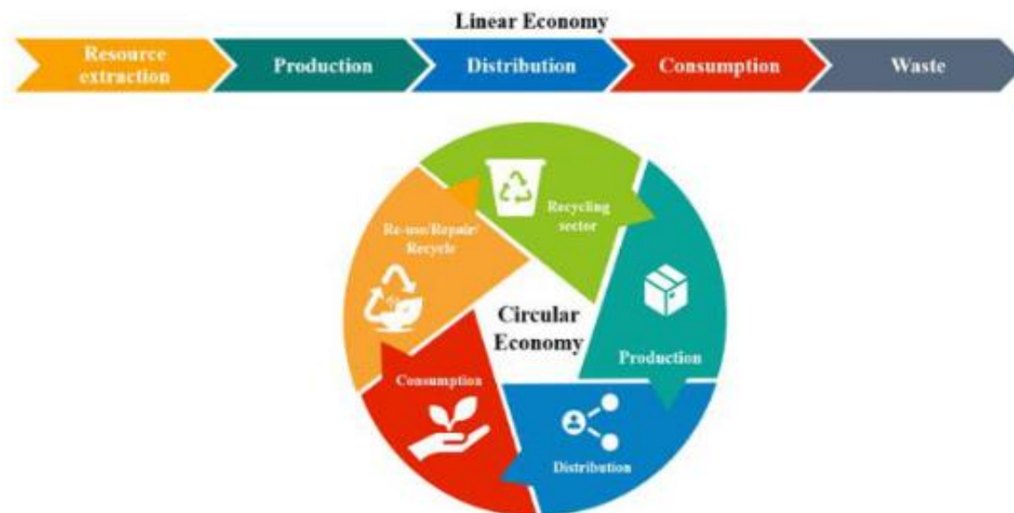
Fig. 2(b). Linear Economy versus Circular Economy. Adapted from Circular Economy and Linear Economy Presentation Graphic [44]