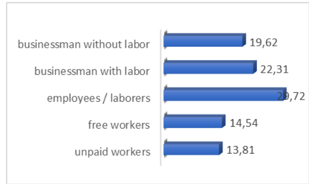
Figure 2. Percentage of Workers by Primary Employment Status in Tulungagung Regency 2019

Based on the results of interviews conducted online business conditions from 5 different respondents. This is because in the time of covid pandemic the type of goods needed by the community more leads to the