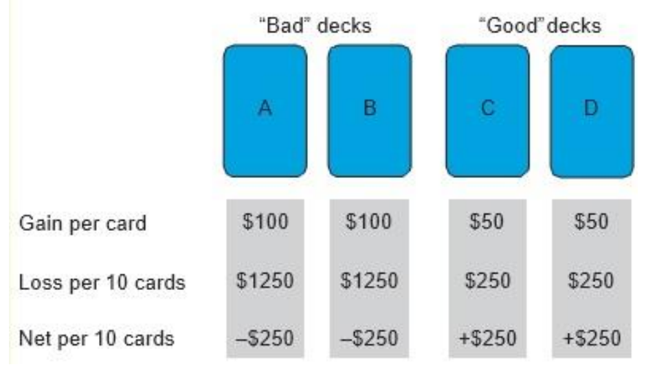
Fig. 3. The Iowa Gambling Task (Antoine Bechara & Damasio, 2005).

From neuroscientific standpoint, the activation in striatum which is located in the basal ganglia is related to the reward process activation by stimuli. The key functions of striatum (i.e., control movements and planning) play a central role in the rewards system, while striatum components (i.e., putamen, caudate nucleus, and nucleus accumbens) have a vital role in evaluating or consumer's expectations compared to actual rewards received (Knutson & Wimmer, 2007; Padmala & Pessoa, 2011) and the influence of social interactions on the striatum regions (Fliessbach et al., 2007; Lehner et al., 2017). Even the ventral tegmental area is part of the reward system, which neurotransmitter dopamine to other brain regions, enabling the modulation of decision-making and affecting in goal-seeking behaviour (Fields et al., 2007; Padmala & Pessoa, 2011). Several neuroimaging studies, Galvan (2010); Geier, Terwilliger, Teslovich, Velanova, and Luna (2010) have used the fMRI technique to test individual developmental changes in the striatum, a region implicated in reward processing. The findings showed that the ventral striatum region plays a vital role of reward anticipation in individuals.