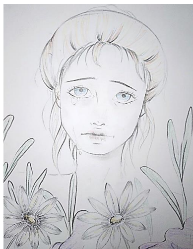
Figure 3. Illustration by an Imaginative Illustrator in the online literature circles

Among the roles, the Imaginative Illustrator was identified as the most challenging (23.1%) and confusing (7.7%). Some thought the role was fun (15.4%), engaging (15.4%), or they loved it (15.4%). The following are the illustration and description given about Ophelia in Act four, Scene five by the Imaginative Illustrator from Group six in her role sheet.