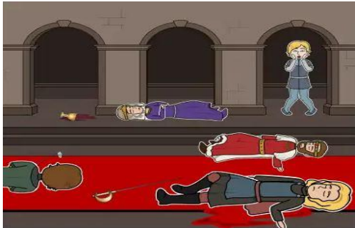
Figure 4. An illustration created by an Imaginative Illustrator using Canva

picture done by the Imaginative Illustrator from Group five shows how he visualized the last act of Hamlet when everyone died at the end of the scene except for Horatio, who later lived to tell the actual tragedy.