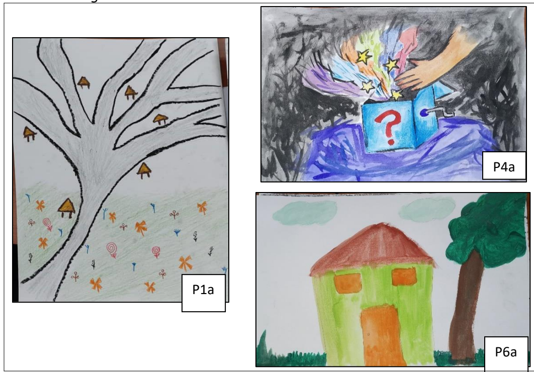
Figure 2 Moratorium stage

* a: drawing on identity status; b: drawing on work value