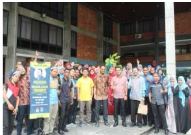
Figure 4:- Discourse of 'Deradicalization and Rehabilitation Program: Experience, Reality and Challenges in Malaysia'.