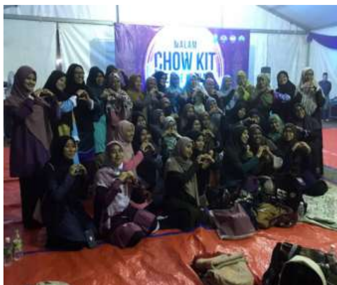
Figure 8:- Program with the Disadvantaged and Homeless at Chow Kit Road.