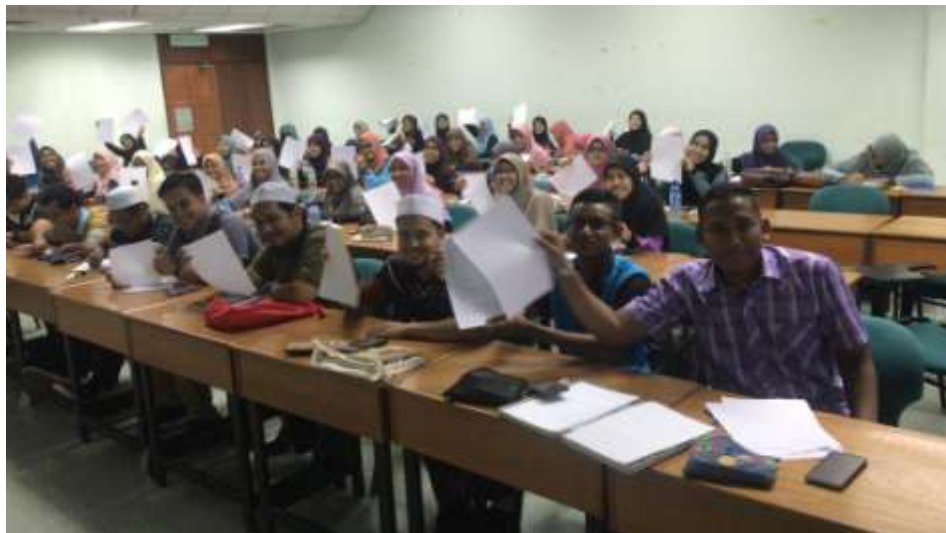
Figure 2:- Students Show a Handwritten Reflection after Reading the 'The Concept of al-Lata'if according to Imam Fakhr al-Din al-Razi in Mafatih al-Ghayb'.