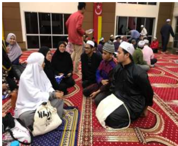
Figure 7:- Students Interacting with the Middle and Upper Social Classes at the Selangor Menteri Besar's Official Residence.