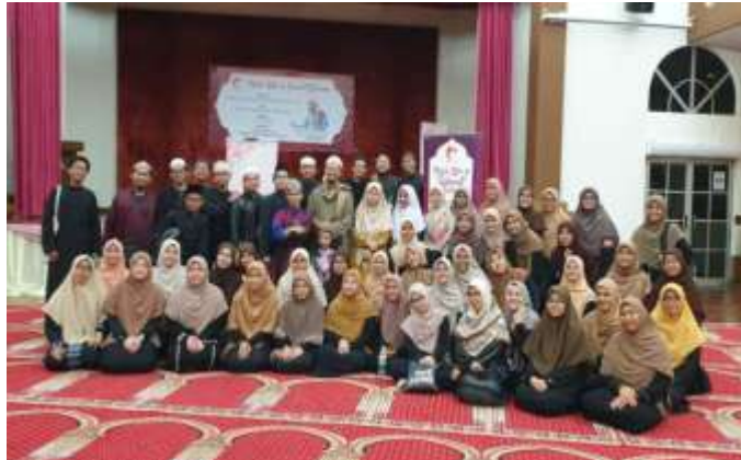
Figure 6:- Zikrullah Program at Selangor Menteri Besar's Official Residence.