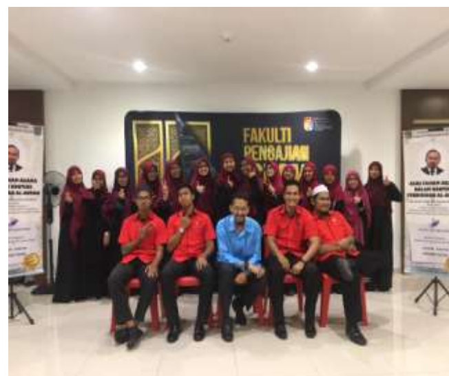
Figure 5:- Discourse of 'Understanding Religion in the Context of Qur'anic Education'.