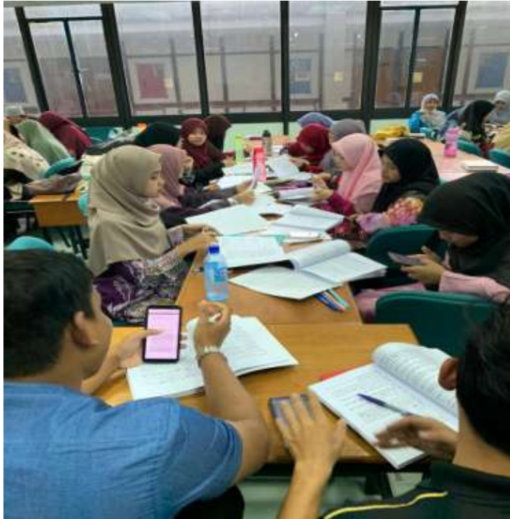
Figure 1:- Students Are Discussing Verse 2 of Surah al-Jumu'ah and the Hadith of Gabriel.

All these student activities were conducted with active involvement of the lecturers. Observations on students' attitudes were conducted to observe their emotions throughout the activities. In addition to written reflections, verbal reflections were also recorded on video (Figure 10). It was analyzed inductively to identify the effectiveness of al-Suhbah and the Qur'anic al-Lata'if concepts applied to this course. The way students conveyed their reflections was examined to identify how they interacted with their affective elements, through body language, voice intonations, and facial expressions. Focus was on identifying whether the student's emotions in affective domain were generated or not.