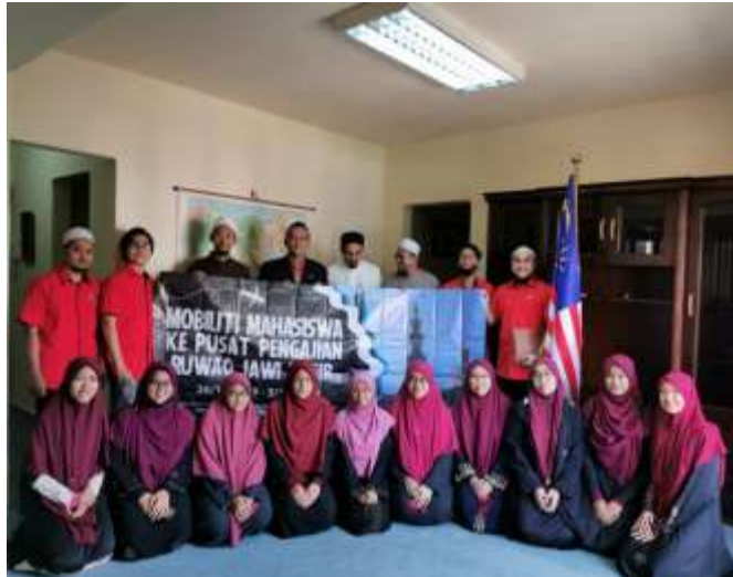
Figure 3:- Student group participating in Ruwaq Jawi Mobility Program, Cairo, Egypt.