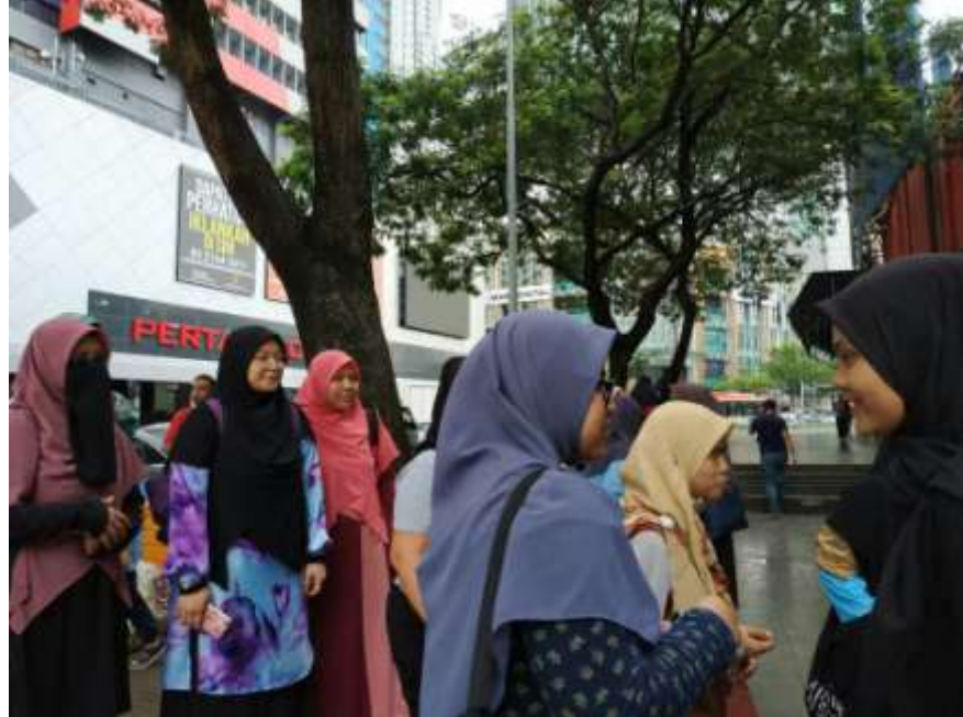
Figure 9:- Street Dakwah Activity.