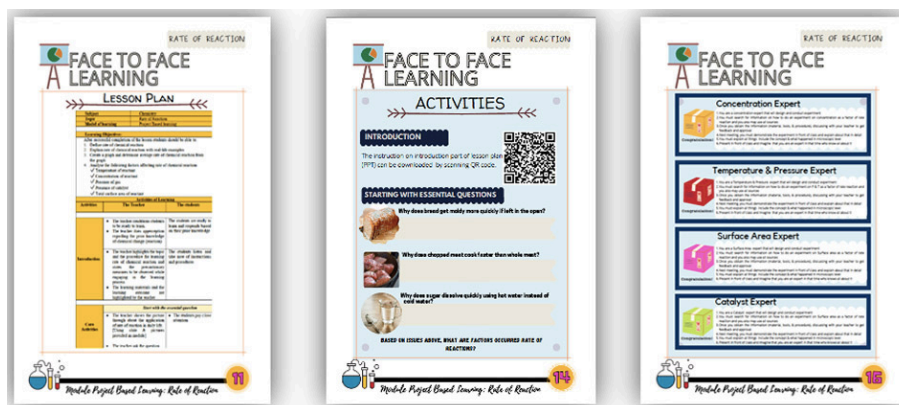
Fig. 2. The face-to-face learning in module

The activities in module ask students for doing project. For example, in face-to-face learning, the students will be Rate of Reaction Expert, they must conduct one experiment related to factors of effecting rate of reaction, the instructions will be provided in the boxes, so the students must select randomly the box. The students will conduct the experiment based on instruction and explain the concept of factors of effecting rate of reaction that involved submicroscopic level. The Figure 2 shows the activities in face-to-face learning.