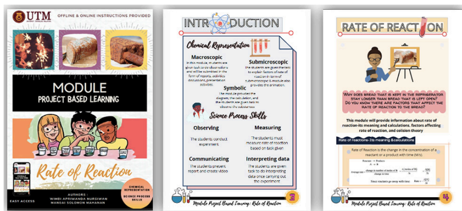
Fig. 1. Cover & the main features in dual mode module

Based on the preliminary of study and the result of analysis, and design, thus, it needs module that can encourage chemical representation and science process skills that can be used in face-to-face learning or online learning. In this module, it provides two lesson plans oriented Project based learning which one lesson plan for face-to-face learning and one lesson plan for online learning. The lesson plan was elaborated through module. The main features in this module are the module provide activities that can encourage science process skills and chemical representations and interactive explanation about rate of reaction. In addition, all activities were designed and developed interestingly that can make students being attractive to learning chemistry. The cover, and the explanation of these features can be seen through Figure 1.