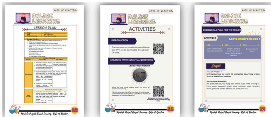
Fig. 3. The online learning in module