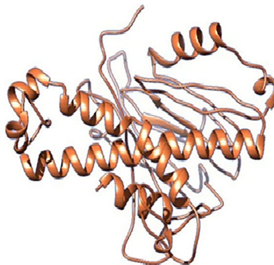
Fig. 1. The structure of the predicted protein. The structure is based on the constructed MEV. trRosetta was used to predict the structure of the vaccine construct. The quality of the structure was predicted as 88.8%.

The epitopes related to B-cells can elicit humoral immunity. The presence of these epitopes in the vaccine design is essential for