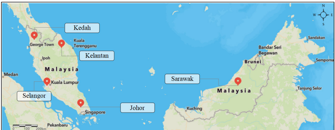
Figure 1. Map of five selected states in Malaysia

where k is the number of estimated parameters in the model and L is the maximum value of the likelihood function for the model. In this study, parameters estimated with a p -value less than 0.05 were considered statistically significant. All analyses were carried out using the statistical programming language R.