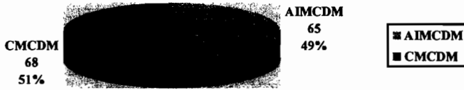
Figure 1. Number of Articles in Journals

Figure 2 shows the number of articles published using specific AI technique or combination of AI technique with either new method or classical MCDM method.