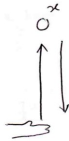
Figure 1. The outcome of Text-Sketch

There is a girl throwing a ball vertically upwards. When reach at position X, the ball is falling towards the ground. What is the velocity of the ball at position X? Describe the motion of the ball in this situation.