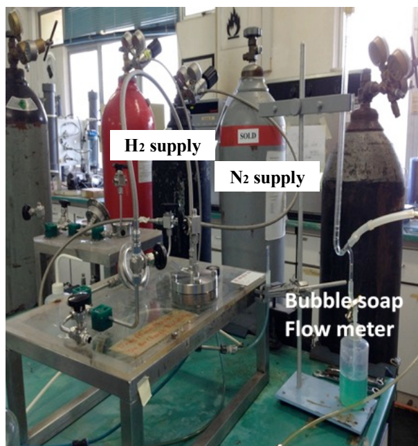
Figure 2: Gas permeation apparatus

where P/l represents gas permeance, Q_i represents gas volumetric flow rate at STP ( \text{cm}^3 (STP/s)), p denotes pressure difference (cmHg), A is the effective surface area ( \text{cm}^2 ), n signifies the number of fibers, D represents the membrane outer diameter (cm) and l is the fiber length (cm). The selectivity, on the other hand, can be defined as the permeation ratio of fast gas over slow gas permeation.