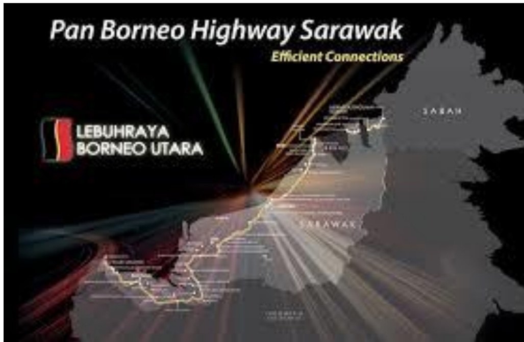
Figure 1.1 Pan Borneo Highway Sarawak Route