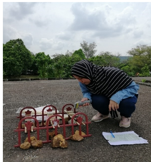
Figure 2. Measure Surface Temperature using IR Thermometer