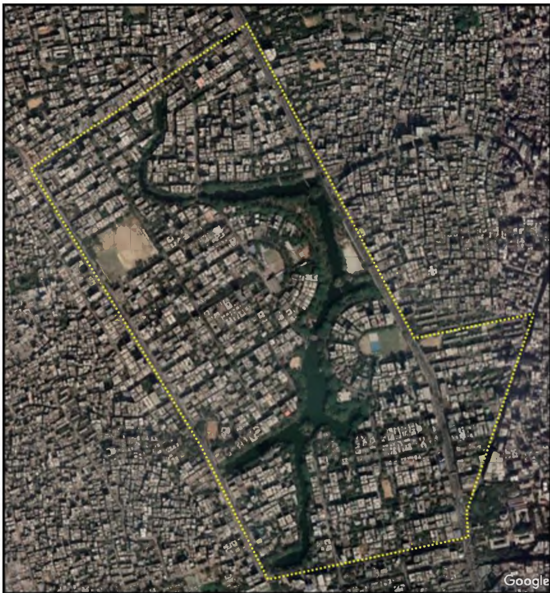
Figure 1.4 Satellite Image of Dhanmondi Lake and Its Surrounding Residential Area.

The underlying design concept of the professional team involved envisaged as to revitalizing the lake and lake side area. It includes primarily decontaminating the water of the lake, shaping the water shade area, opening it up and making it easily accessible to the public. All of this was done through a public private partnership (Hossain et al., 2009)