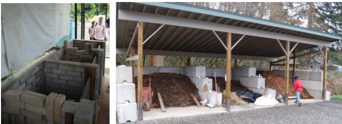
Figure 3. Food waste composting using Shallow compartment technique (JPBD, 2012)

The technique of shallow compartment is a method of composting that takes place in a covered area or in a special building. Through this process, the waste is collected at a depth of less than two meters in the upper part of the open compartment. Figure 3 displays the Shallow compartment technique of the FW decomposition process. In this process, ventilation can be done manually every week or two by reversing compost. The floor area of the compartment can be modified by providing a drainage system for leachate discharge and air ventilation (JPBD, 2013). This method gives a better effect of using green waste, brown waste or dried twigs as composting agents. However, this technique gets tough with the high cost of site preparation and maintenance. Due to the high cost of site preparation and management is the challenge of this technique, and this technique is also inadequate in the housing sector, which is commonly known for housing in narrow and dense urban areas. Nonetheless, this strategy gets tough with the high cost of site preparation and management, as well as being inadequate at limited space and dense areas like urban, because this technique requires a large space.