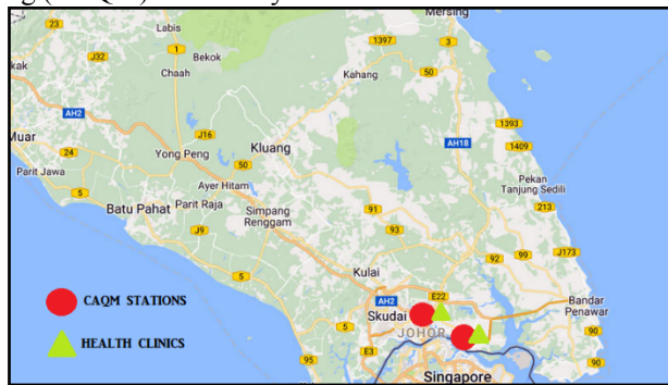
Fig. 1. Spatial distribution of Continuous Air Quality Monitoring stations and studied health clinics in Johor.

With prevailing winds blowing north-eastward during the haze period, prolonged and large-scale forest fires in Sumatra and Kalimantan are almost certain to bring plumes from fires in Borneo to the southern part of Malaysia, especially Johor. Therefore, this study was conducted in Larkin and Pasir Gudang, Johor. Figure 1 shows two of the Continuous Air Quality Monitoring (CAQM) and nearby health clinics located at the urban areas of Johor.