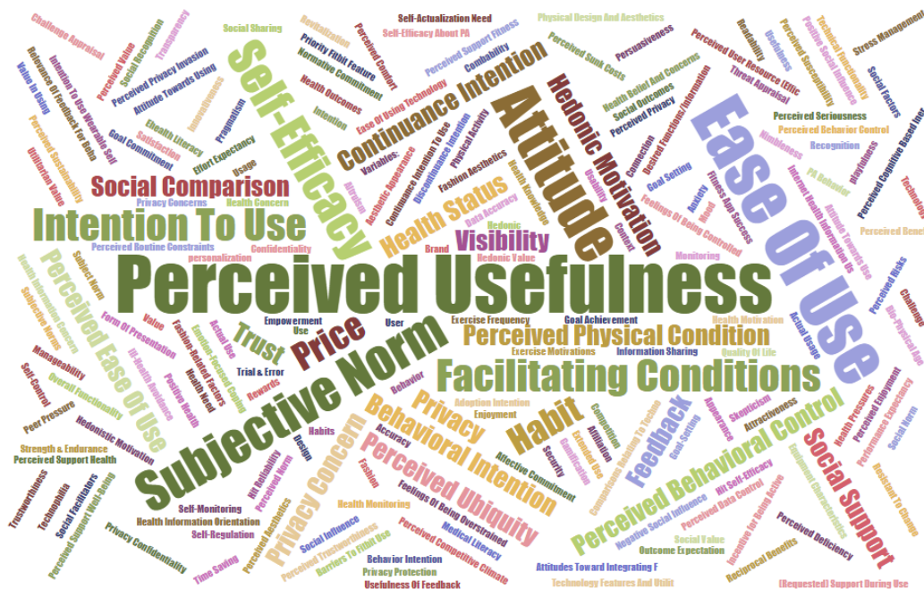
Figure 1. A Wordcloud view of extracted variables in the SLR

Since the domain of this study is still immature, most of the analysts were to address the adoption. However, the result of locating contestant variables is much of favor to TAM constructs. For example, there are 17, 14, and 8 unique counts included perceived usefulness, perceived ease of use, and attitude respectively. In additional, the analysis reveals that Subjective Norm (10), Continuance Intention (8), Hedonic (7), Self-Efficacy (6), and Behavior Intention (5) are the other top variables used in prior PATT-SM studies to tackle the continuance issue. Figure 1 exhibits a Wordcloud view and Table 1 shows the ranking of all identified variables from prior studies of PATT-SM. All these variables can be classified as, for example cognitive belief, value, social, and health related. Consequently, the result can be further applied in building a research model.