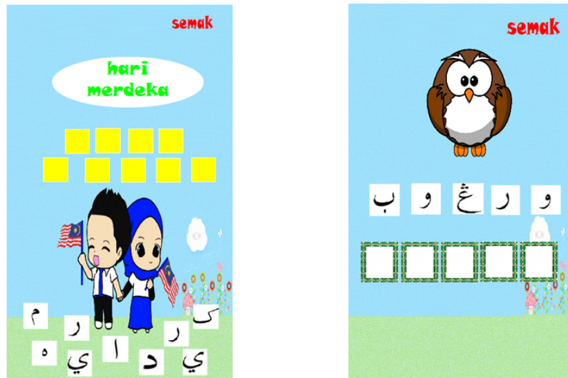
Fig. 2. Game Interfaces (Drag and Drop)

Figure 1 shows the flowchart of the process of the 'Oh Jawiku' app developed. This application is simple and consists of just a few pages with clear visual content so that students can easily browse and use this app without any help. There are four levels of the game in the 'jom eja Jawi' section designed according to the syllabus of Jawi year two primary schools.