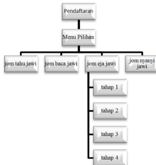
Fig. 1. Flow Chart of the Mobile Apps

Each process carried out in this second phase will have a relationship with each other to ensure that the process is not dropped. Additionally, the quality of work needs to be ensured performed will meet the needs of end users as well as the stated objectives. In addition, each design will be applied through the process of designing mobile game applications using constructivism learning theories.