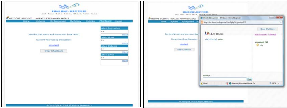
(c) chat venue entry

Debate and discussions will take place in the designated chat rooms which will engage students in online discussions. Instructors will be able to post conferences, and students will be able to post questions, ideas, ways and perspectives to solve problems posted earlier. Figure 1(c) and 1(d) show how and where students may do so in the system.