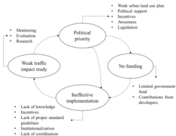
Fig. 1. Issues of the Practice of TIA in Developing Countries. Adopted from [20]

TIA had been implemented in Malaysia since the early 90's [19] but traffic problems still continue to grow. Mainly because, the practice of TIA in Malaysia is not getting the attention or legal statutory as EIA to benefits from the advantages of TIA to its full potential in reducing the traffic impacts of the development. There are various issues faced in the implementation of TIA especially in developing countries and Malaysia do not shy from these issues [7], yet there are little studies conducted in addressing these issues. Political priority is the main reason for discrepancies between developed and developing countries [20]. TIA is well defined in developed countries with legal framework to promote the necessity of TIA and the stakeholders are dedicated to ensure TIA is implemented in an effective manner. Whereas, in developing countries, there are lacking in key elements in the practice of TIA, summarised in Fig. 1.