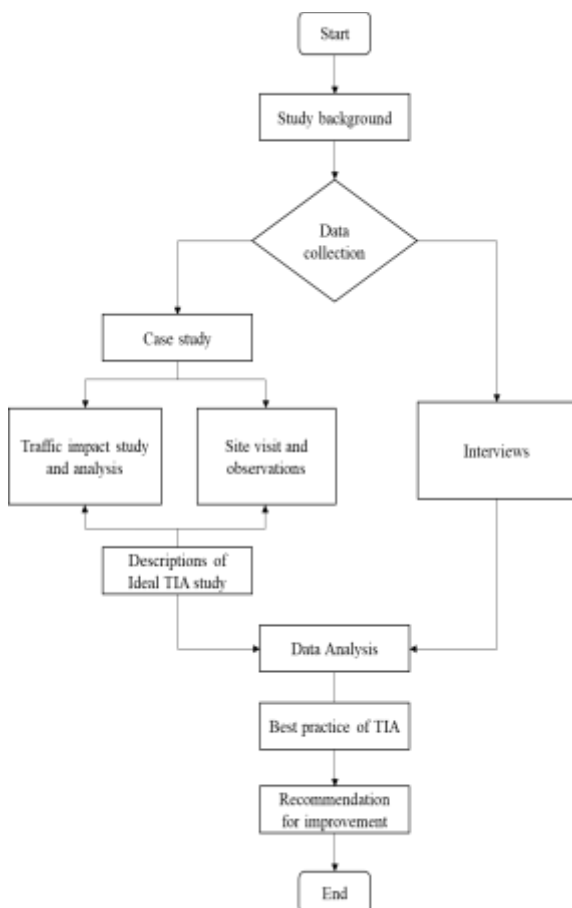
Fig. 2. Methodology of the study

While in developing country, the development of roads has brought extensive negative impacts for example, the deterioration of urban areas, increase in ineffective land use, increase in roads and traffic that affected the rates of deaths