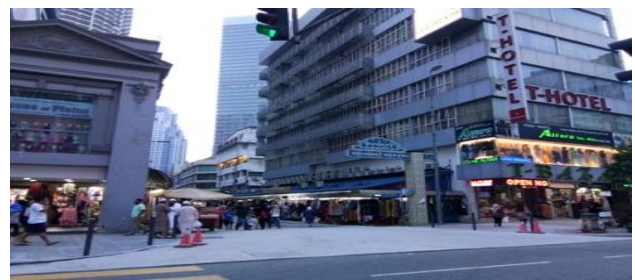
Fig. 3 Crowded side lane with many shops and pedestrian

"..I feel insecure because there are so many foreigners along this sidewalk, especially for me with my kids. I feel like there is no freedom and I don't feel like we are living in Malaysia"