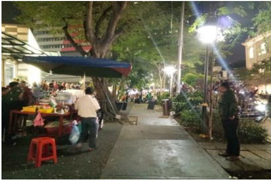
Fig. 5 Disrupted linkages in front of Sogo

In terms of demographic usage of the street, it is mostly dominated by women from morning until night time where most of them are workers and students. Data from observation concurred that women needs for safety is crucial in order for them to feel safe while using the street.