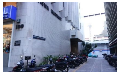
Fig. 4 Side lane

Human presence is important not only on the main street but along the side lane where there are connected to parking area and leading to public transport. From observation it is found that there is side lane which is quite due to the design. It is dedicated for motorcycle parking and there is no visual surveillance from inside of the building as shown in Figure 4.