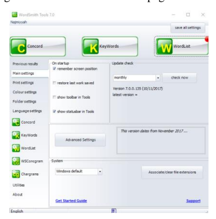
Figure 2. Main page of WordSmith 7.0

For this research, we used a concordancing software programme called WordSmith 7.0 to conduct the text analysis. WordSmith 7.0 is considered as one of the most comprehensive and established software for corpus linguistics [16]. Its website also offers step-by-step tutorial on how to use the software. The software needs to be purchased and downloaded from its website. As with other text analysis software, WordSmith 7.0 requires the corpus to be in the form of txt files in order to use it for corpus analysis. Figure 2 below shows the main page of WordSmith 7.0.