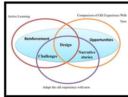
Fig II: Theoretical Framework

classroom execution are key factors for interactive games that can no longer be regarded as a key tool in learning and teaching reading skills. In this research, the researcher will address the identified technical problems and issues of interactive game implementation for reading skills and producing interactive games that give a good impact on students learning. The interactive game design will focus on learning theories, learning strategies and game elements so that student's achievement, student's engagement and student's interest can be improved in learning reading skills.