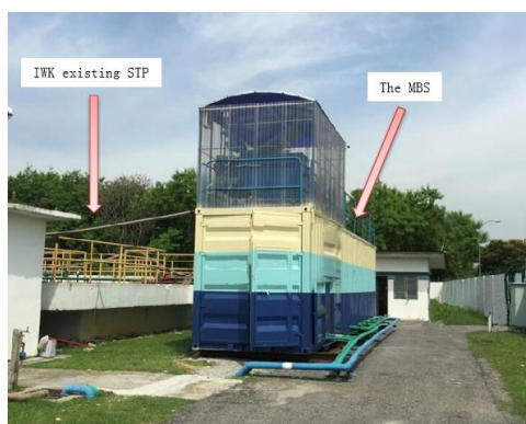
Figure 1: The pilot-scale MBS installed next to the IWK STP

The pilot-scale MBS system was situated at an existing STP managed by Indah Water Konsortium (IWK) in Kuala Lumpur, Malaysia. The MBS system is shown in Figure 1. The existing STP was operated using the conventional EA process and has a rated capacity of 17,000 population equivalent (PE). However, the STP was operated at 7,000 PE loading. The STP was fed via a collection sump (or pump sump), which was fixed with a bypass valve that routed 500 PE of the untreated wastewater to the MBS. The conveyor screening at the sump removes the larger solids and they were not fed into the MBS system. The system also experienced wet weather conditions where the influent might be diluted by the rain water.