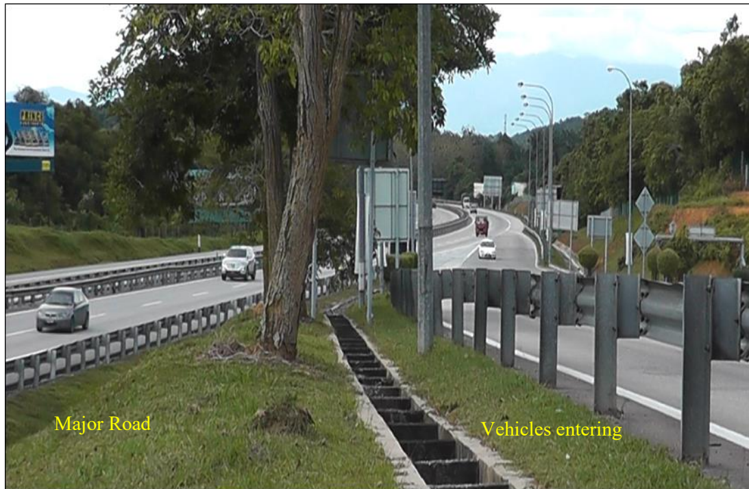
Figure 1. Placement and viewing angle for the digital video camera.

Then, the data aggregation for counted data which had been made by choosing the highest parked vehicle within the observed hour as representative as peak parking occupancy as stated in ITE analysis procedure [22]. Parking occupancy is defined as the percentage of occupied spaces and is typically examined on hour-by-hour basis. The second phase, parking occupancy will be plotted for each site to determine the pattern of parking behaviour across a period of time. Once the parking trends are presented, statistical estimation can be drawn between measured parameters and parking occupancy.