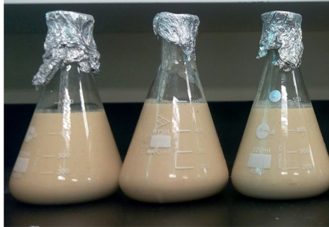
Fig. 1. Chicken viscera homogenate.

the best values found from the studied conditions were used as the constant values until each of all the parameters were studied at a time.