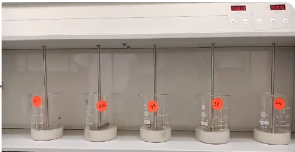
Fig. 2. Biofloculation test.

The flocculation efficiency of the biofloculant was estimated according to the techniques of Kurane et al. and Xiong et al. Briefly, 2 mL of crude biofloculant and 3 mL of 1% CaCl 2 were mixed with 100 mL of Kaolin clay solution (4 g/L) in 500 mL beaker and the pH adjusted to 7.0 ± 0.1. The beaker containing the mixture was mounted to a flocculator (JLT 6 Velp Scientifica, Italy) (Fig. 2) and stirred at 200 rpm for 1 min followed by 80 rpm for 5 min and finally held still for 5 min. The absorbance of the upper part of the mixture and the control (where 2 mL sterile medium was used in place of the