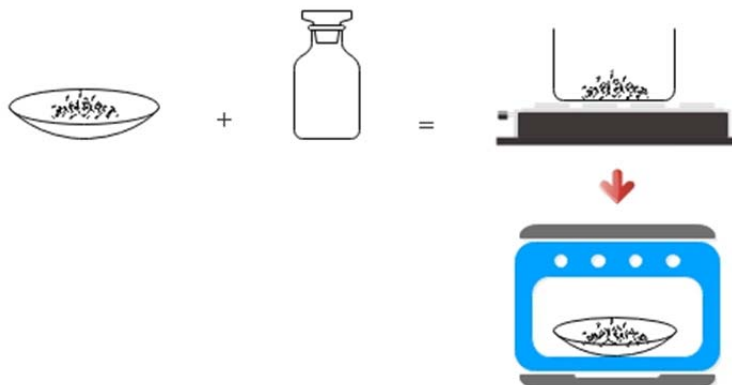
Figure 1: Flow diagram in the determination of extractives