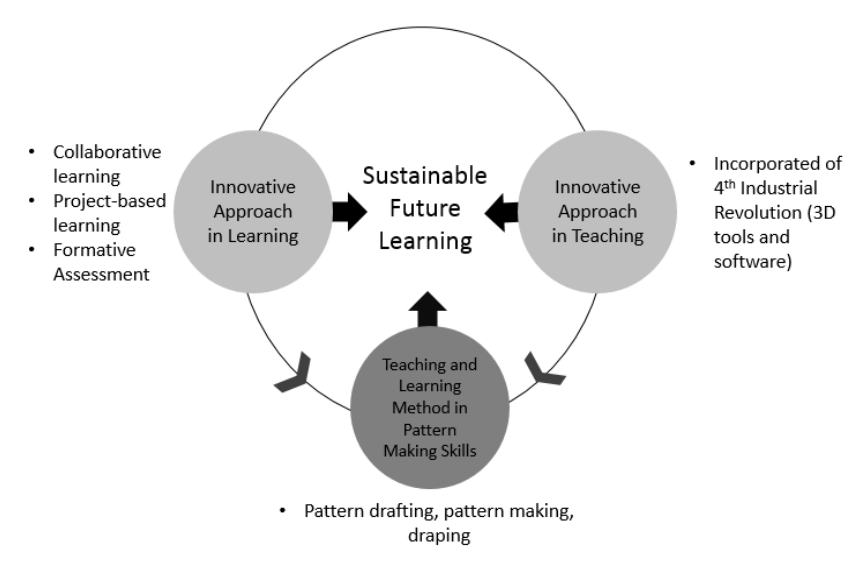
Figure 1.0 Integration of innovation in pattern making skills.

Figure 1.0 shows the conceptual framework of integrating innovation in pattern making skills. The framework is divided into two approaches, for further understanding. The first sphere shows the approach in learning method. Students can adapt innovative learning method though collaborations, project-based learning and progress assessment (formative assessment). As for the second sphere, the teaching approach can incorporate with the current trend of industrial evolution, through the application of 3D tools like 3D pen, 3D simulation or pattern making software. Such simulation will enhance their technical design learning experiences in a virtual setting. 3D garment simulation has been used as a tool to enhance students' understanding of 3D concepts in medicine, architecture, science, accessory design, and automotive industry design (Hwang, 2016).