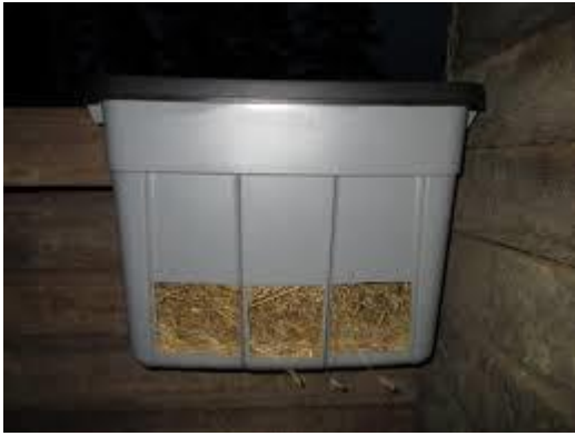
Images 4.11: Food Container Without Rooftop (Left) With Cover (Right)