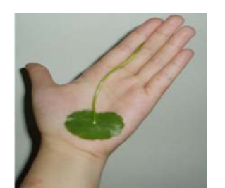
Figure 1. The first accession : small near smooth round leaves with diameter of 3.75cm