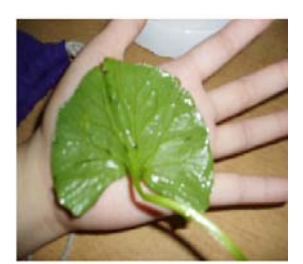
Figure 2. The second accession : big edge leaves with diameter of 7.85cm