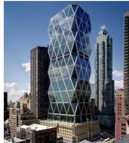
Figure 1.1: Diagrid Building (a) Capital Gate Building (b) Alda Headquarters (c) Atlas Building and (d) Hearst Tower.