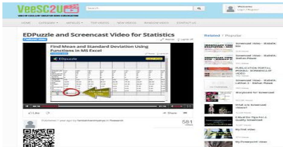
Fig. 1. Interface for SVOR.

According to Nielsen [38], the minimum sample for usability test is five. The teachers were compelled to take Islamic Studies curriculum in order to fulfil the requirement to get their Diploma in Education. The screencast videos are recorded which presentations of a lecturer's note. We proposed Screencast Video Online Repository (SVOR), which enables students to access screencast videos by utilizing 2D barcode as shown in Fig. 1. The 2D barcode for all videos in SVOR automatically created by the website. Therefore, users can download the videos easily which can be accessed at www.camtasia2u.com . Related to the matter, the authors chose Camtasia Studio software to produce the videos due to the available editing tools such visual effects.