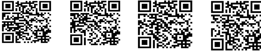
Fig. 2. Sample of QR codes for screencast video online.