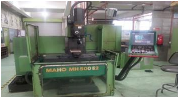
Figure 1. 3 Axis CNC Milling Machine

For conducting the real experiment, a 3 Axis CNC Milling Machine was used, MAHO MH500E2 as illustrated in Figure 1. The tool and material used were 5mm High Speed Steel, HSS with twist drill bit and Cold Mold Steel 718. Twist drill is the common tools used with DHD and are designed to make round holes quickly and accurately in all materials. HSS was selected because of widespread use in the manufacturing and machining [17]. The chemical composition of Cold Mold Steel 718 includes 0.37% C, 0.3% Si, 2.0% Cr, 1.0% Ni, 1.4% Mn and 0.2% Mo. Cold Mold Steel was selected because of the several advantages based on the handbook of 718 SUPREME Edition 7 which no hardening risks, time saving, lower tool cost and easily carried out.