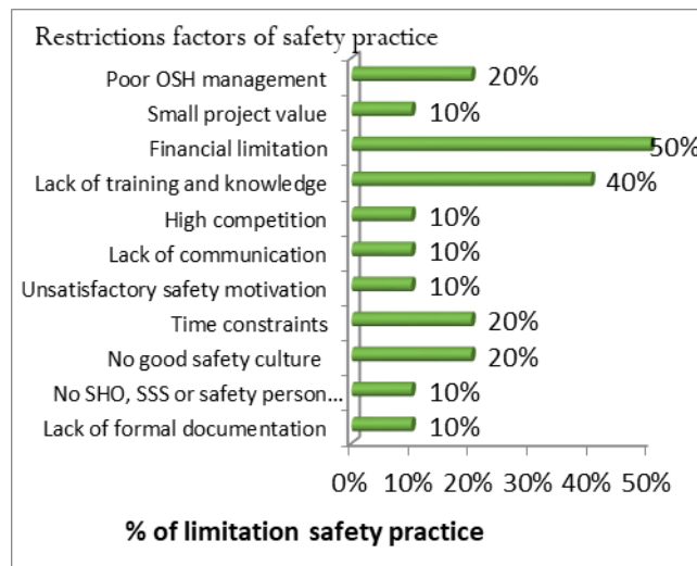
Figure 3 Restriction Factors to Implement Safety Practices in Small Grade Contractors

with good safety culture (20%) respectively. Moreover, small project value; high competition; lack of communication; unsatisfactory safety motivator; do not have SHO, SSS and safety person in charge; and lack of OSH formal documentation (10%) respectively.