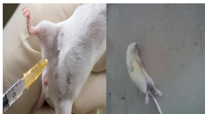
Fig. 2 Mice after seizure induced by sc-PTZ.

The PTZ (CD 97 ) test exploits a dose of pentylenetetrazole (85 mg/kg) to induce clonic convulsions that produces clonic seizures lasting for a period of at least five seconds in 95 % of the tested animals. Mice were divided into five groups (n = 6): the first group was pre-treated with normal saline (10 mL/kg); three groups of six mice each were given 300 mg/kg, 100 mg/kg, and 30 mg/kg body weight of the isolated compound, respectively; and the last group of six mice was pre-treated with sodium valproate (200 mg/kg) and served as positive control. After 30 minutes post-treatment, the convulsant was administered subcutaneously and the animals were individually monitored for the presence or absence of clonic spasm (of at least five seconds duration) to determine the compound ability to abolish the effect of pentylenetetrazole on seizures threshold [19]. The onset of twitching and myoclonic jerks were also recorded.