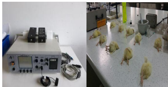
Fig. 1 Graphic picture of chicks after delivery of electroshock seizure.

placed on the upper eyelids of the chicks. A shock duration, frequency, and pulse width were set and kept at 0.8 s, 100 pulses/sec and 0.8 m/s respectively. A current of 75 mA which produced tonic seizures in 95 % of the control chicks was used throughout the study. Groups of chicks (n=10) were administered with normal saline (10 mL/kg), isolated compound (30, 100, and 300 mg/kg) and phenytoin (20 mg/kg) thirty minutes prior to the administration of shock. An incident of tonic extension of the hind limbs was regarded as full convulsion and the recovery time was recorded in unprotected animals, while lack of tonic extension of the hind limbs was regarded as protection.