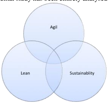
Fig. 1: Fit Manufacturing

Past research explains fit manufacturing in various ways including complete fit manufacturing constructs. The literature review is based on past studies and a review of fit manufacturing literatures. The experimental study has been entirely analysed by [4, 8-18]