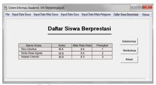
Fig. 5: High Achieving Student List.

Figure 5 shows high achieving student list.