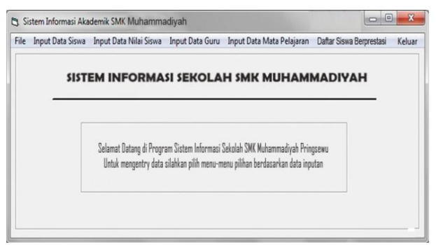
Fig. 1: Main Menu Form.