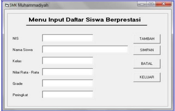
Fig. 4: Achieving Student Data Input.

Figure 4 shows achieving student data input.