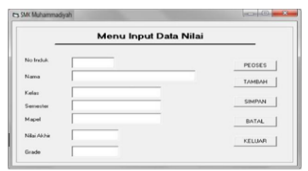
Fig. 2: Score Data Input.