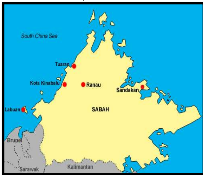
Figure 3: Map showing location of KK, Sabah, Malaysia

Capital city of Kota Kinabalu (KK) that surrounded by about 400 territorial POS (in 2013) within Country land including Native land (rural) and Town land (urban) with an approximate area and population of 351 km 2 and 452,058 (year 2010) respectively which, falls within the West Coast Division of Sabah, Malaysia (Figure 3), was selected as the site study. Hitherto, only both headquarters of KK Lands and Surveys Department (LSD) and City Hall (CH) as the key informants (policy-makers) were focused as their verdicts made concerning practice in POS governance are constitutionally enforced in all other districts of the State.