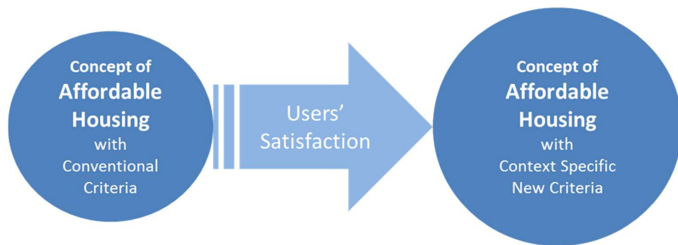
Figure 1.2 Search for criteria of Affordable Houses through Users' Satisfaction

contributes and adds to the existing housing research and literatures in housing studies in Nigeria. However, the purpose of the study is not to produce definitive conclusions, or to provide generalizable results, but to provide a basis from which academics and practitioners in urban and regional planning, housing research and housing policy can begin to understand and explore this under-researched area. The study is therefore designed to fill an existing research gap in the field of housing research in Nigeria with particular reference to Ibadan, which will be of interest to Planners, Economists, Architects and researchers alike. The diagrammatic representation of the conceptual framework indicating the significance of the study is shown in Figure 1.2, and Figure 1.3.